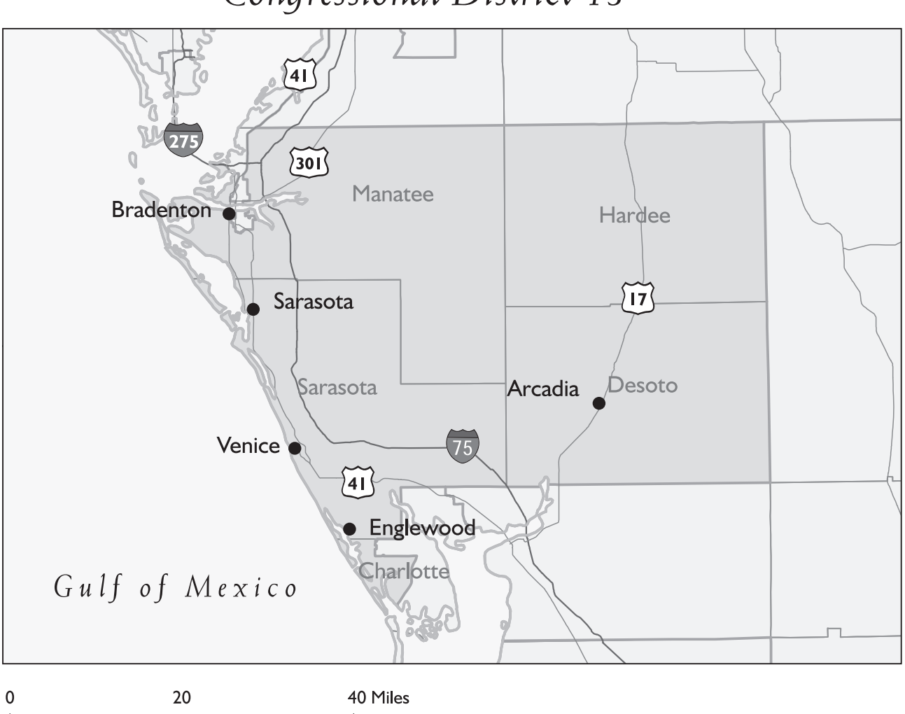
Congressional District 13